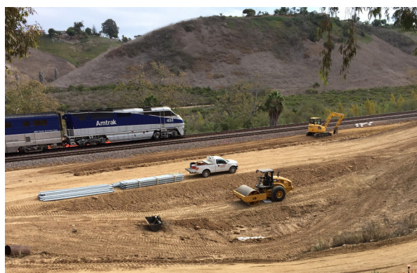
Crews install a new track crossover in University City.

The second rail project under construction is the Control Point Rose Track Crossovers Project, part of the Elvira to Morena Double Track Project in the University City area. Work activities include removing and replacing track; installing culverts, drainage crossings, and a rail crossover; and realigning the track.