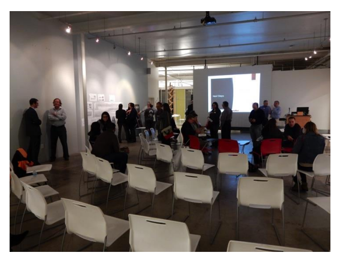
with specific questions about the project.