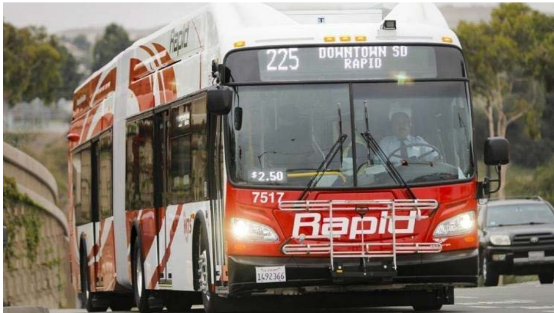
South Bay Rapid limited bus, route Rapid 225, between the East Palomar Street Transit Station and downtown San Diego that began Sept. 4, 2018.

South Bay Rapid bus service connecting downtown San Diego to eastern Chula Vista , and eventually to the border crossing in Otay Mesa, opened Tuesday — a significant boost for the public-transit system as outlined in the region's often-divisive blueprint for mobility.