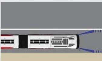
Lane Departure Warning