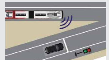
Ramp Metering Transit Priority System