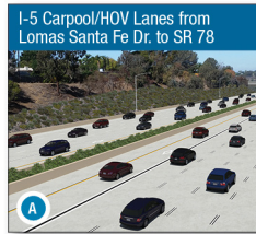
I-5 Carpool/HOV Lanes from Lomas Santa Fe Dr. to SR 78