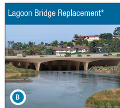
Lagoon Bridge Replacement*