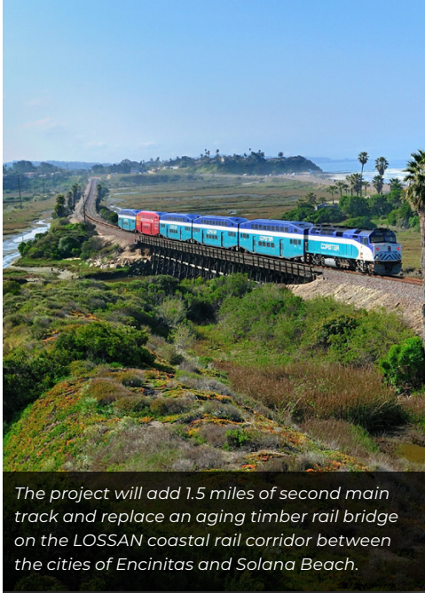
The project will add 1.5 miles of second main track and replace an aging timber rail bridge on the LOSSAN coastal rail corridor between the cities of Encinitas and Solana Beach.