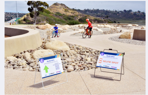
Visitors walked and biked to the newly enhanced I-5 Vista Point to experience the panoramic view of all the improvements to the San Elijo Lagoon Ecological Reserve and surrounding community.