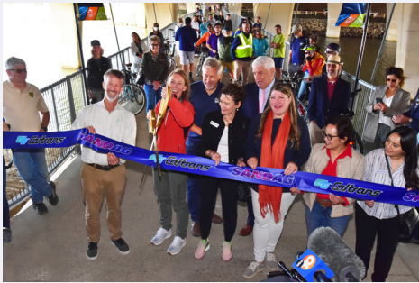
Festivities began with a Ribbon Cutting ceremony to celebrate the improvements in and around the San Elijo Lagoon Ecological Reserve including a 154 acre restoration and creation of new biking and pedestrian trails.

If you missed it, check out the Explorer’s Guide to learn about the new bikeways and walkways, and watch highlights from the event here!