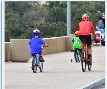
Bicyclists head south on the completed suspension bridge - catching a refreshing breeze with a beautiful view.