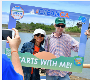
Visitors on walking paths took photos to capture the incredible sights from the new trails.