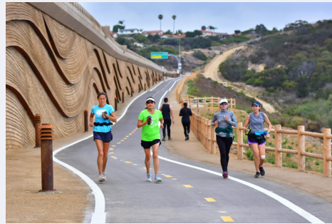
Visitors enjoyed the new extension of the Solana Hills walking and biking path which runs along the west side of Interstate 5, south of Manchester Avenue.