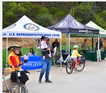
Our agency partners provided support for our guests with opportunities to meet local animals at the San Elijo Lagoon Ecological Reserve and Nature Center or try out an e-bike from Encinitas BCycle.