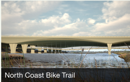
North Coast Bike Trail

The seven-mile North Coast Bike Trail will connect Solana Beach to northern Encinitas and expand the regional bike and pedestrian network. A suspended bike and pedestrian bridge will be built underneath the San Elijo Lagoon highway bridge to further increase north-south and east-west connectivity and accommodate multimodal travel options.