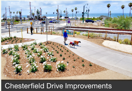
Chesterfield Drive Improvements

New coastal access improvements have been completed along the Los Angeles-San Diego-San Luis Obispo (LOSSAN) rail line. These include a pedestrian rail undercrossing at the southern end of the San Elijo Lagoon and the redesigned at-grade rail crossing located at Chesterfield Drive. Both projects allow pedestrians to safely cross the rail line and expand coastal access within the Cardiff-by-the-Sea community. The Chesterfield Drive improvements also allowed the City of Encinitas to obtain a Quiet Zone designation at the rail crossing, eliminating a requirement for train engineers to sound the horn when approaching the at-grade crossing.