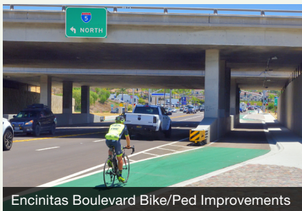
Encinitas Boulevard Bike/Ped Improvements