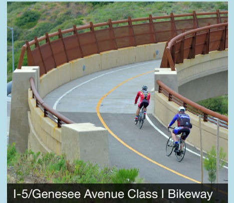
I-5/Genesee Avenue Class I Bikeway

Another critical North Coast Corridor mobility project includes a new 1.5-mile stretch of protected Class I bikeway, along the west side of I-5, connecting the Sorrento Valley Transit Station to major employment hubs in the San Diego communities of La Jolla and University City. This new section of bikeway, completed in 2018, was critical to closing a gap in the greater regional bike network, allowing bikers to now travel unimpeded between Mission Bay and State Route 56 (SR 56).