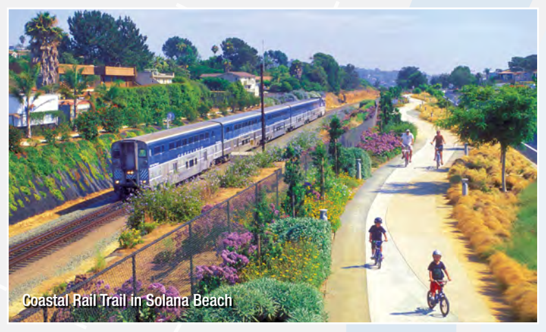
The NCC Program will improve transportation choices and enhance the quality of life for residents.

The NCC Program supports the immediate and future transportation needs of the corridor while preserving the character of coastal communities and creating opportunities for neighborhood enhancement projects. These projects include adding nearly 30 miles of bike and pedestrian paths, incorporating local art and design elements, and preserving open space.