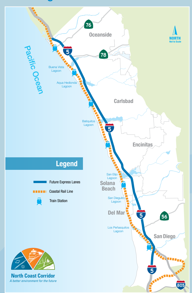
The NCC is a 27-mile-long corridor that includes the cities of Oceanside, Carlsbad, Encinitas, Solana Beach, Del Mar, and San Diego.