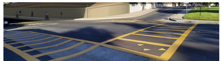
Chestnut Avenue in the City of Carlsbad - Before and After