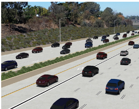
New Carpool/HOV Lanes on I-5 (One in each direction)