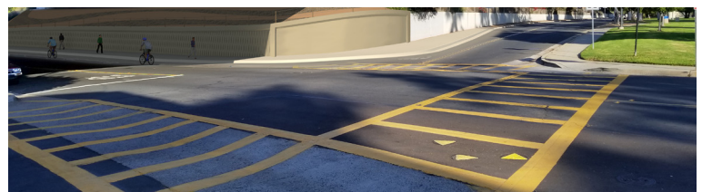
Chestnut Avenue in the City of Carlsbad - Before and After