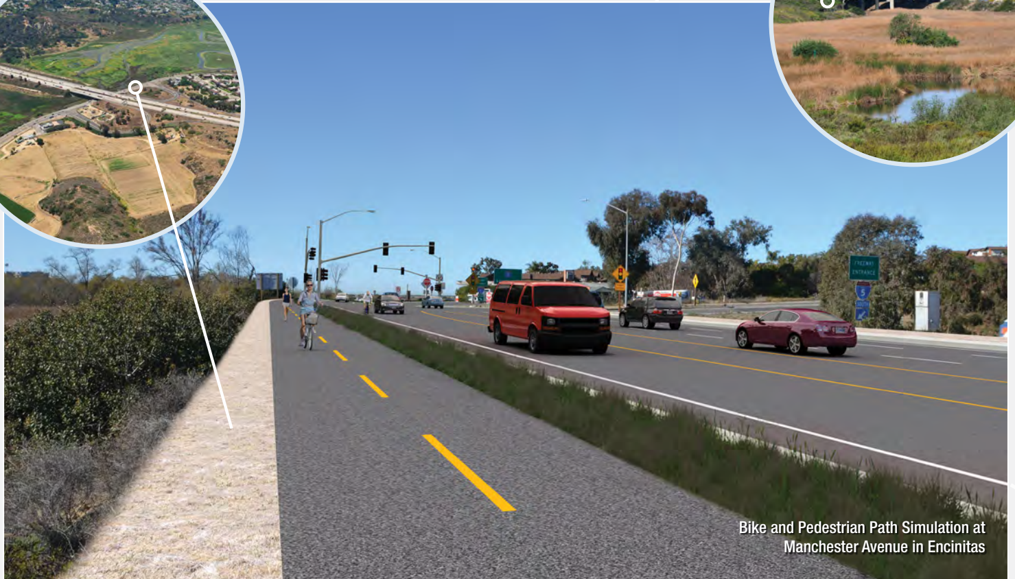
Bike and Pedestrian Path Simulation at Manchester Avenue in Encinitas