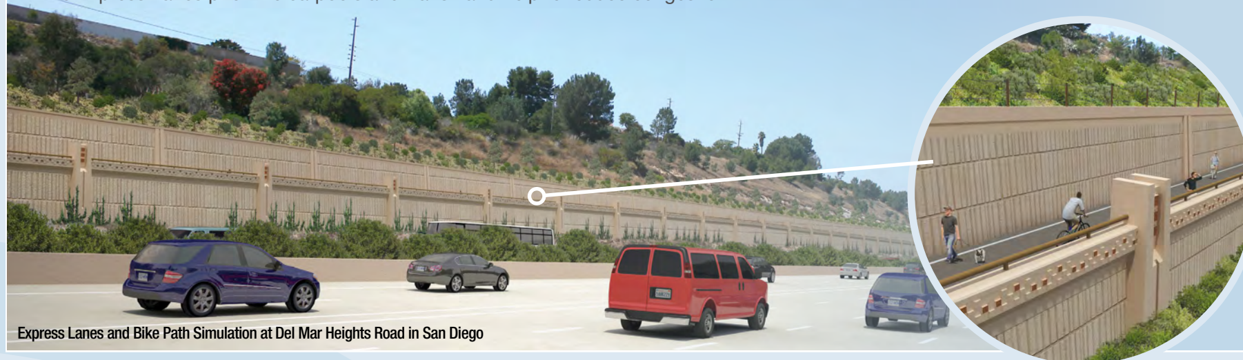
Express Lanes and Bike Path Simulation at Del Mar Heights Road in San Diego

The aging I-5 has gone more than 40 years without major capacity improvements. To keep up with the way transportation choices are evolving, we need a freeway of the future – one that makes it easier to access our coast, our jobs, and our homes. The I-5 Express Lanes Project will add two Express Lanes on I-5 in each direction from La Jolla to Oceanside. The Express Lanes prioritize carpools and transit and help to reduce congestion.