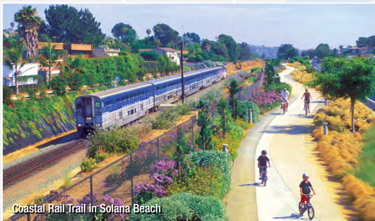
Coastal Rail Trail in Solana Beach

The NCC Program supports the immediate and future transportation needs of the corridor while preserving the character of coastal communities and creating opportunities for neighborhood enhancement projects. These projects include adding nearly 30 miles of bike and pedestrian paths, incorporating local art and design elements, and preserving open space.