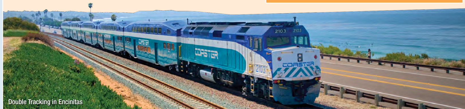
Double Tracking in Encinitas

Includes a proposed bus rapid transit line along the coastal communities