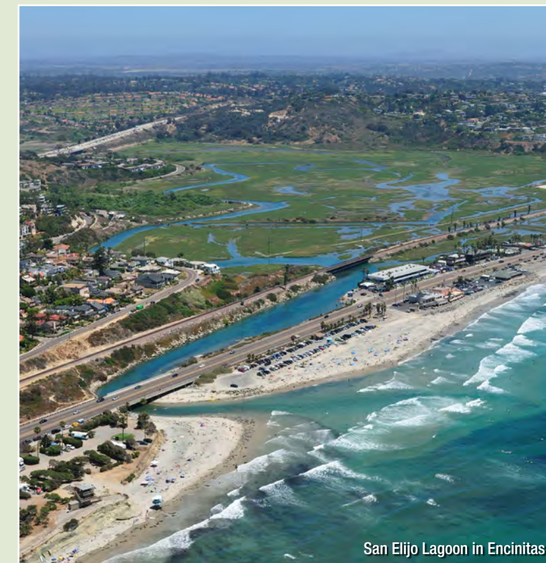
San Elijo Lagoon in Encinitas

Safeguards the water quality of the six coastal lagoons