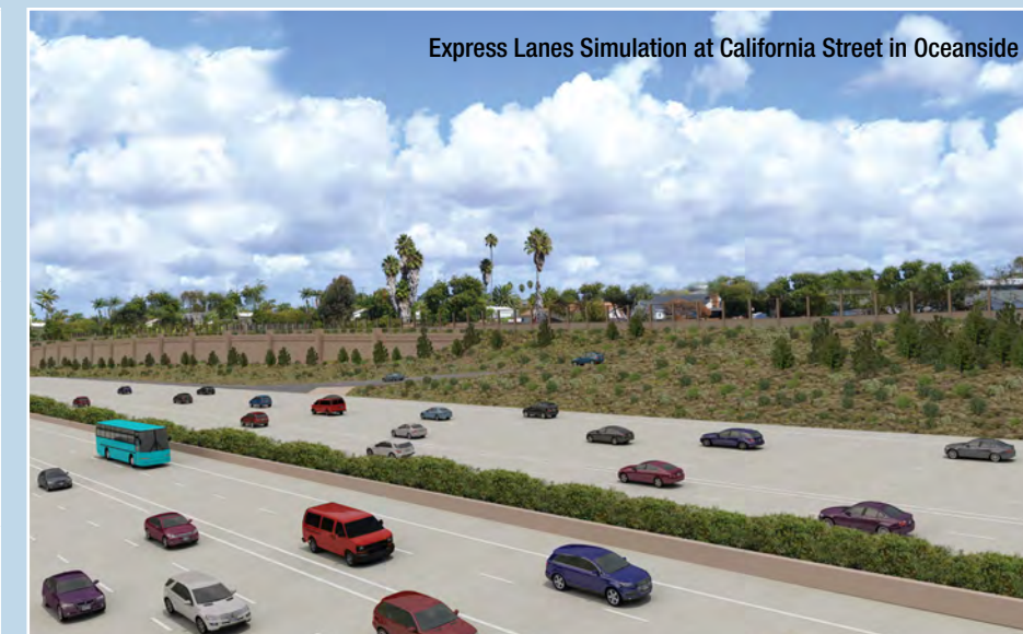
Express Lanes Simulation at California Street in Oceanside

Accommodates flexibility for land use changes and transportation technology