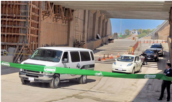
Federal, state and local officials participated in Wednesday's ribbon-cutting ceremony for the I-805 HOV/Carroll Canyon Road Extension Project.

On Wednesday, March 5th, the San Diego Association of Governments (SANDAG) and the California Department of Transportation (Caltrans) commemorated two projects that will bring new choices for commuters throughout San Diego County. Federal, state, and local officials gathered with business and community members near project sites along Interstate 805 (I-805) at Carroll Canyon Road in the Golden Triangle and Logan Avenue in