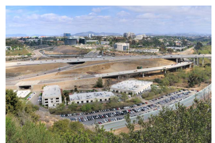
The I-805 HOV/Carroll Canyon Road Extension Project. (Click photo to enlarge.)