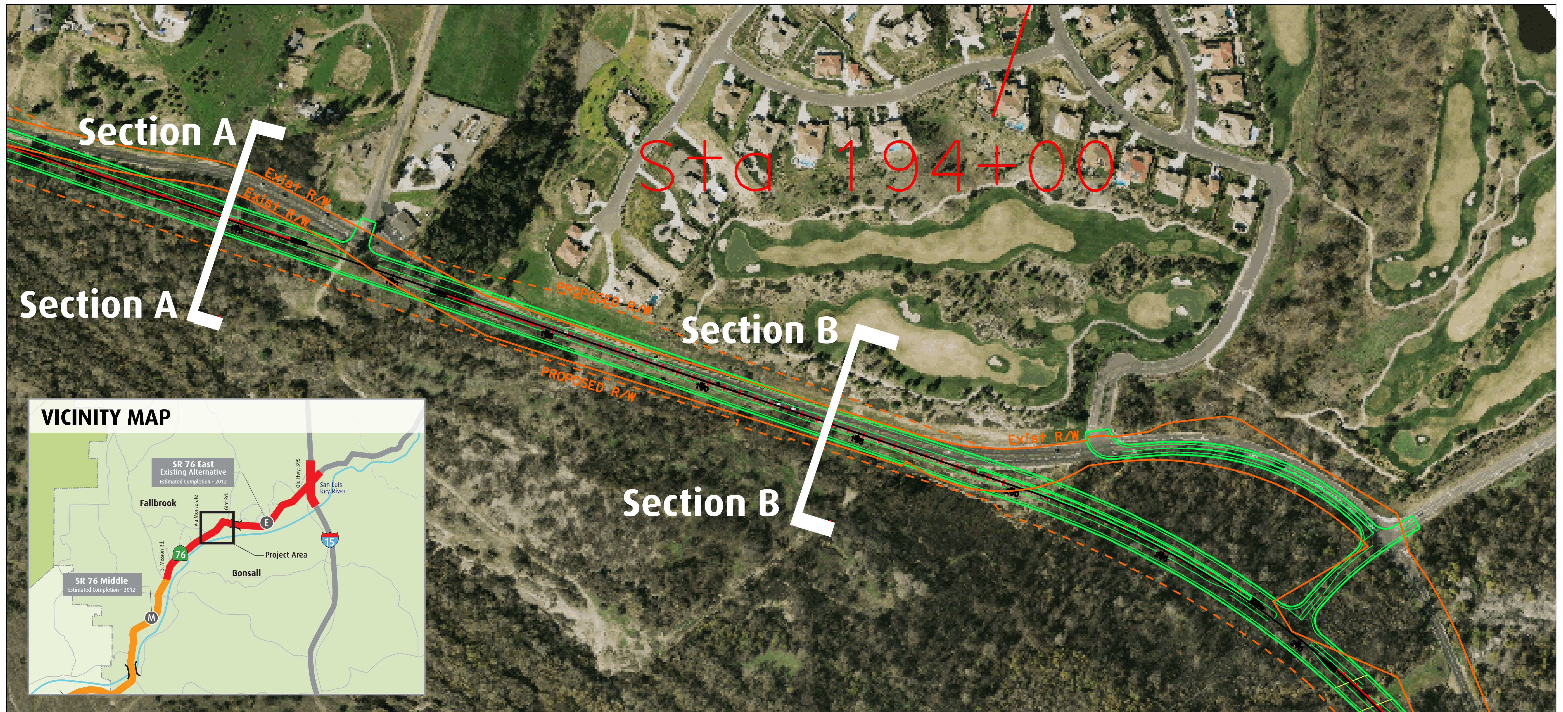
Proposed Existing Alternative: Plan View