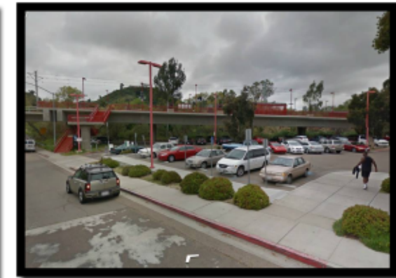
MISSION VALLEY STATION, SAN DIEGO, CA