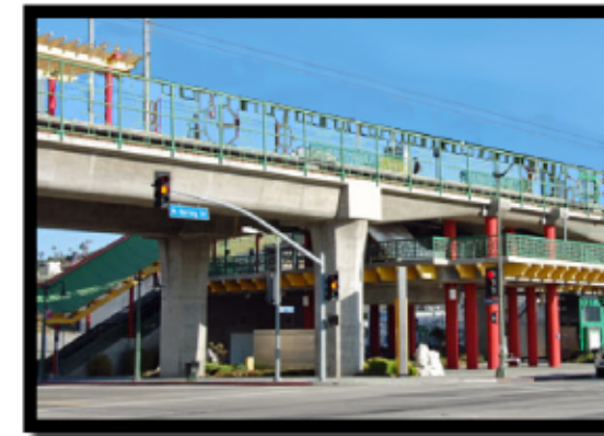
CHINATOWN STATION, LOS ANGELES, CA