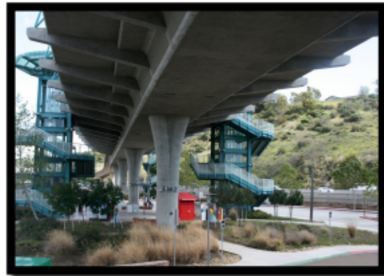
GRANTVILLE STATION, SAN DIEGO, CA