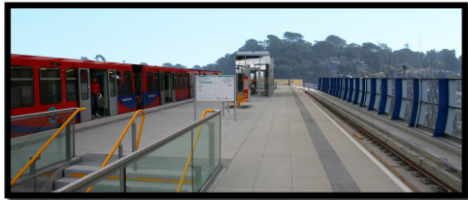
CITY AIRPORT STATION, LONDON, UK