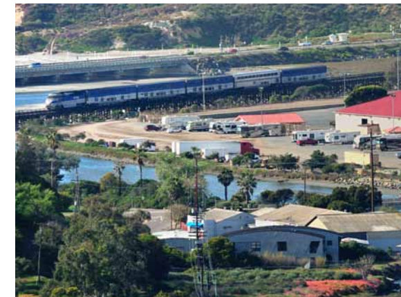
The San Dieguito Double Track and Special Events Platform Project is one of several rail improvement projects planned in the North Coast Corridor.

The project is being planned in close collaboration with other local and regional stakeholders including the cities of Solana Beach and Del Mar, San Dieguito Riverpark Foundation, 22nd District Agricultural Association, and regional transit organizations. SANDAG will coordinate the design, construction, and funding for the project, and NCTD will continue to own, operate, and maintain the rail line. SANDAG and Caltrans Division of Rail have secured $9.5 million in funding from local and federal sources to date. A portion of the project is funded through the Passenger Rail Investment and Improvement Act (PRIIA), a FRA program that authorized the appropriation of funds specifically to improve the nation's rail services. Additionally, the project is partially-funded through TransNet , the San Diego County voter-approved one-half cent sales tax to fund a variety of transportation projects. The project is funded through the preliminary engineering and environmental phases only. Therefore, a construction start date has yet to be determined.