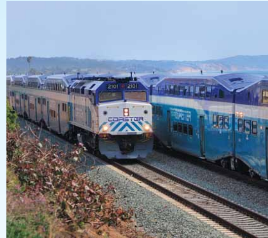
The Project will add 1.1 miles of double track, improving on-time reliability and passenger travel times.

As of late 2012, slightly more than half of San Diego County's rail corridor is double tracked, with an additional 11 miles in design or under construction. More than 97 percent of the corridor will be double tracked by 2030. Other key rail enhancement projects along the corridor include bridge replacements, pedestrian undercrossings, and other safety and operational improvements. Together, these projects represent SANDAG's plan to construct approximately $800 million in infrastructure along the San Diego County section of the LOSSAN rail corridor in the near term.