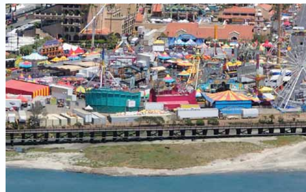
The special events platform will provide a direct connection to the Del Mar Fairgrounds for rail passengers.

The proposed platform will be active during special events only and will help reduce vehicular traffic in the area during heavily-attended events at the Fairgrounds. The proposed platform will be accessible to trains traveling both north and south. The double track and proposed platform are part of SANDAG's goal to increase transit ridership by improving reliability and providing direct links to San Diego's most desirable coastal destinations.