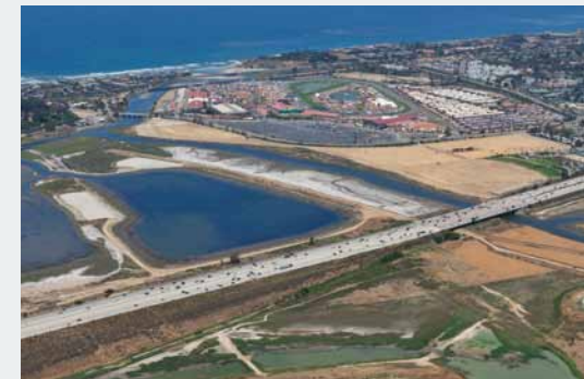
The NCC Program offers a balanced transportation system to provide travelers choices for the future, while enhancing the quality of life for residents.

The San Dieguito Double Track and Special Events Platform Project is part of a package of improvements planned for the NCC to offer more transportation choices and enhance coastal habitats. Over the next few decades, the NCC Program will invest $6.5 billion in highway, rail, transit, and environmental protection and coastal access improvements.