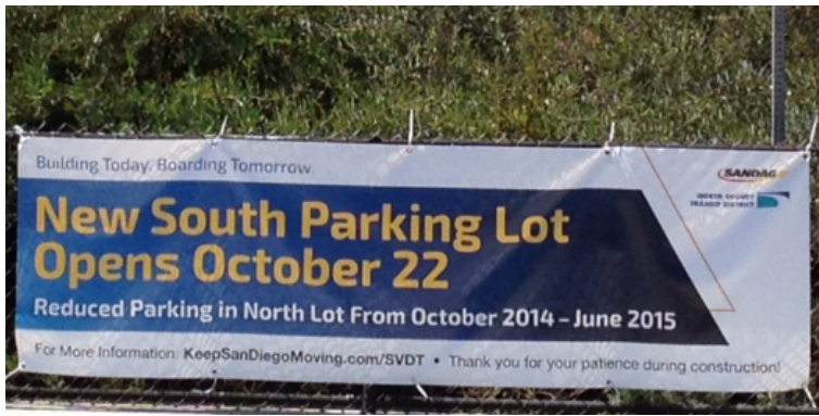
Signage is posted around the station and North Lot detailing upcoming construction activities.

Upcoming construction activities to build two railroad switches will require partial closure of the North Lot between Wednesday, October 22 – Friday, October 24. Only ADA parking will be available in the North Lot. All other station users should park in the new South Lot. Any vehicles left in the North Lot during this time will be moved to the new South Lot.