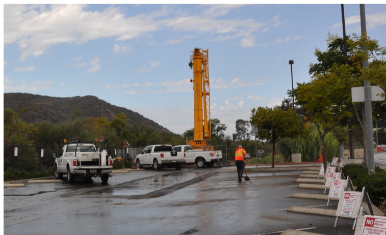
The construction team makes progress on installing new drainage systems.