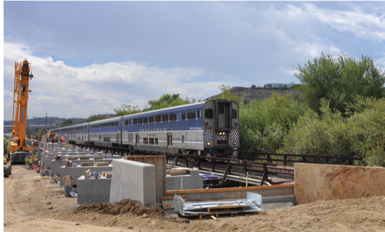
Crews work to pour piles for a new concrete bridge.

If you plan to park at the station during this time, please be aware that approximately 25 parking spaces will not be available overnight during construction hours. Signage will be posted in advance and vehicles left in these spaces overnight will be subject to towing. We appreciate your patience during construction.