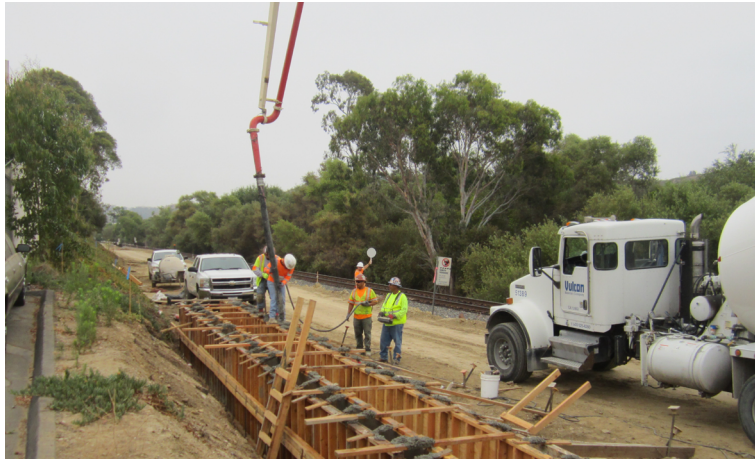
The construction team makes progress on building new drainage structures.

In order to accommodate construction improvements along the LOSSAN rail corridor, SANDAG has planned a series of "Absolute Work Windows" (AWWs) when portions of the track will be shut down over selected weekends. During these windows, no trains will run in the corridor beginning late on Friday evening through early Monday morning. NCTD will post information regarding alternate travel options during these times. The next AWW is scheduled for the weekend of October 25-26, 2014.