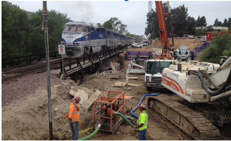
Crews work to pour piles for a new concrete bridge.

SANDAG is scheduled to begin making storm drainage improvements to the existing northern parking lot in mid-August. Work will occur primarily during the nighttime hours of 9 p.m. to 5 a.m. and will last approximately two weeks. It is anticipated that 30 parking spaces per night will be blocked off to the public during this time. SANDAG will be working with the North County Transit District (NCTD) to inform riders prior to the start of construction. Once the final schedule is determined and the work commences, commuters can expect to see clear signage in the northern lot specifying which parking spaces will be unavailable for overnight use.