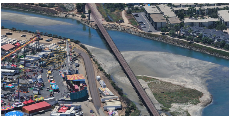
The new special events platform will be located on the west side of the fairgrounds.

Pending funding, the project would construct a one-mile stretch of second main track between Solana Beach and Del Mar, replace the nearly 100-year-old wooden trestle rail bridge over the San Dieguito River, and add a special events rail platform on the west side of the Del Mar Fairgrounds. The project is part of the North Coast Corridor Program, a comprehensive package of highway, rail and transit, and coastal access improvements, which spans 27 miles from Oceanside to La Jolla.