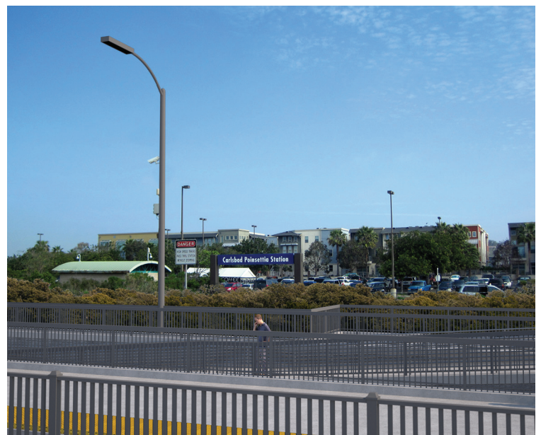
Visual simulation of planned platform improvements: looking east