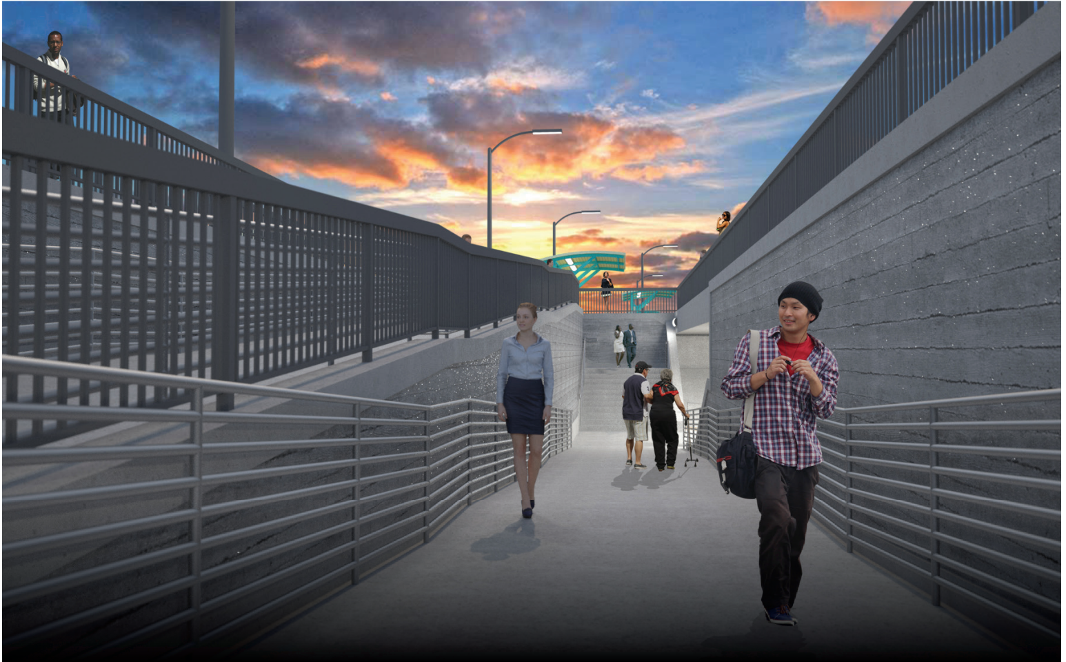
Visual simulation of planned platform improvements: perspective from pedestrian undercrossing ramp

LOSSAN Los Angeles San Diego San Luis Obispo Coastal Rail Corridor San Diego Segment