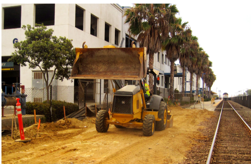
The project will increase the capacity of the entire LOSSAN system with the addition of a new third track and platform.