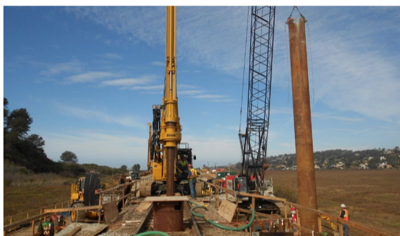
During the rail closure, crews installed support columns on the center bridges.

Construction crews are working to replace four wooden trestle railway bridges as part of the Los Peñasquitos Lagoon Bridges Replacement Project . Construction crews made significant progress over the past two weekends, completing all of the support columns on the northernmost bridge over the lagoon.