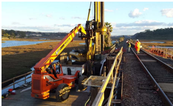
Crews work to place CISS piles at the northernmost bridge at the Los Peñasquitos Lagoon.

Construction crews are working to replace four wooden trestle railway bridges as part of the Los Peñasquitos Lagoon Bridges Replacement Project . During the January AWWs, workers will