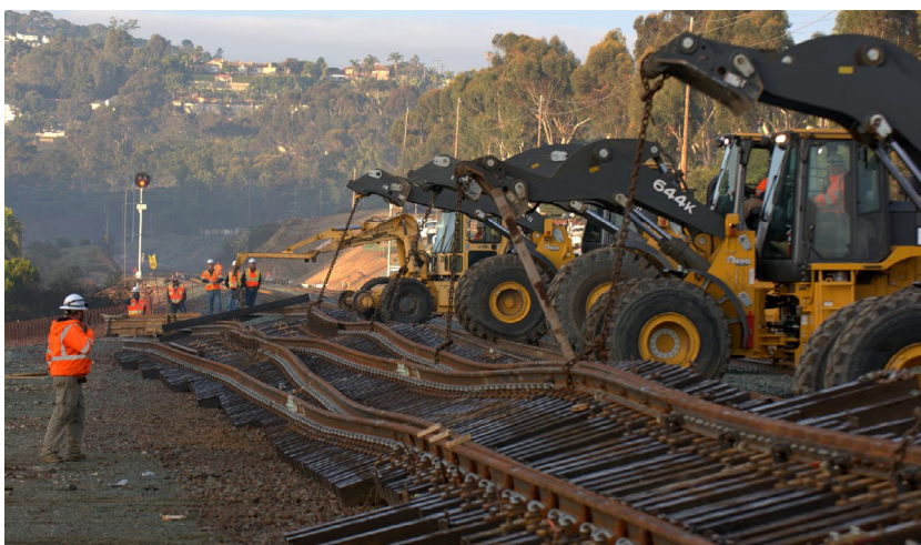
Crews move a new railroad crossover into place.

Since work began in August 2015, crews have completed six AWWs at the Control Point (CP) Rose Track Crossovers Project site, located at the railroad tracks where Regents Road ends.