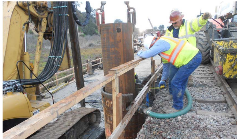
Crews work to place support columns on a center bridge.

Construction crews made significant progress on the Los Peñasquitos Lagoon Bridges Replacement Project last month. As a result of the January weekend rail closures, or Absolute Work Windows (AWWs), SANDAG completed the remainder of the support columns on the northernmost bridge. The benefit of weekend rail closures is crews are able to meet construction milestones by working unimpeded while all rail services are halted from early Saturday to early Monday.