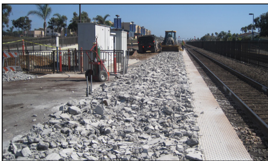
Crews will be completing the demolition of Platform 1 this weekend.

Crews are making great progress on the Oceanside Transit Center Platform Improvement Project and will be completing the demolition of the southern end of Platform 1, the existing easternmost platform at the station. Anticipated AWW work also includes the installation of a new crossover just south of the station between Eucalyptus Street and Oceanside Boulevard, and other track work in the project area.