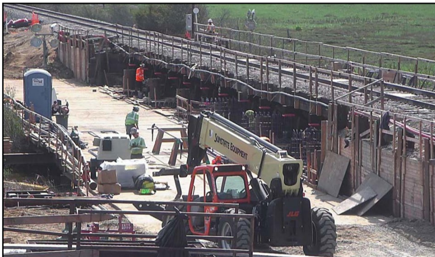
Crews work on building the new Los Peñasquitos bridge structure.

Construction crews are working to replace four wooden trestle railway bridges as part of the Los Peñasquitos Lagoon Bridges Replacement Project . This weekend, construction crews will demolish sections of the old, northernmost railroad bridge over the Los Peñasquitos Lagoon and place steel support beams to frame and support the new span.