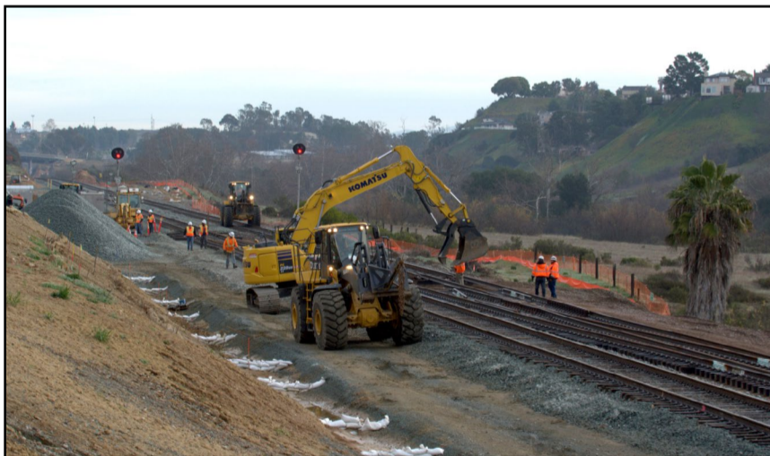
Crews work to install new crossover at Control Point (CP) Rose.

Construction also will be occurring on the three southern rail bridges. Crews have made significant progress on installing the support beam foundations and will be working primarily on erecting falsework and constructing the ends, or bent caps of the new bridges.