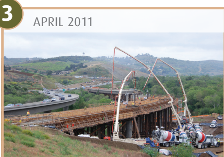
Construction of frame 3, structure on the west side of the new bridge.