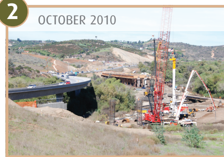
Construction of frame 1, structure on the east side of the new bridge.