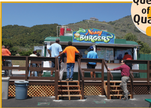
Nesy Burgers at Pala Mesa Market shopping area