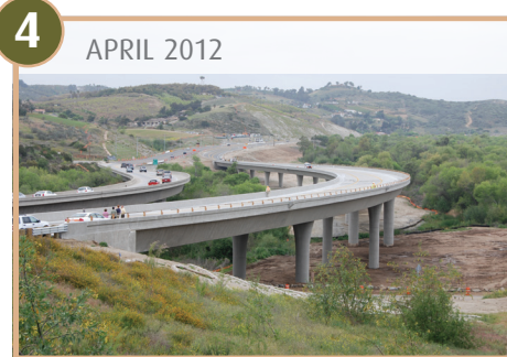
The newly constructed San Luis Rey River Bridge.