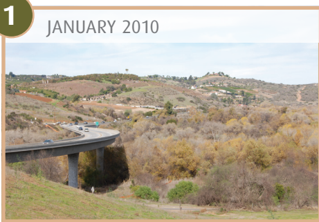
Area prior to bridge construction.