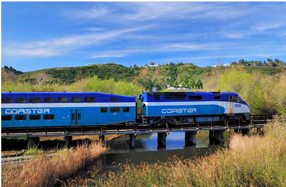
An NCTD COASTER train passes over an aging wooden trestle bridge in the Sorrento Valley area.

The project will help to improve the reliability and on-time performance of COASTER, Amtrak, and BNSF Railway services by removing a bottleneck in San Diego's coastal rail line and allowing passenger and freight trains to pass each other as they enter and leave the Sorrento Valley transit station.