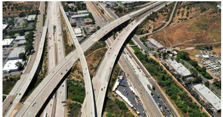
Looking south towards Sorrento Valley, the I-5/I-805 interchange lies at the top of the Golden Triangle area.

Phase Two will add two more miles of second track and straighten sharp curves that currently cause passenger and freight trains to slow as they climb Miramar Hill. The second phase is in environmental review and is not yet funded for construction.