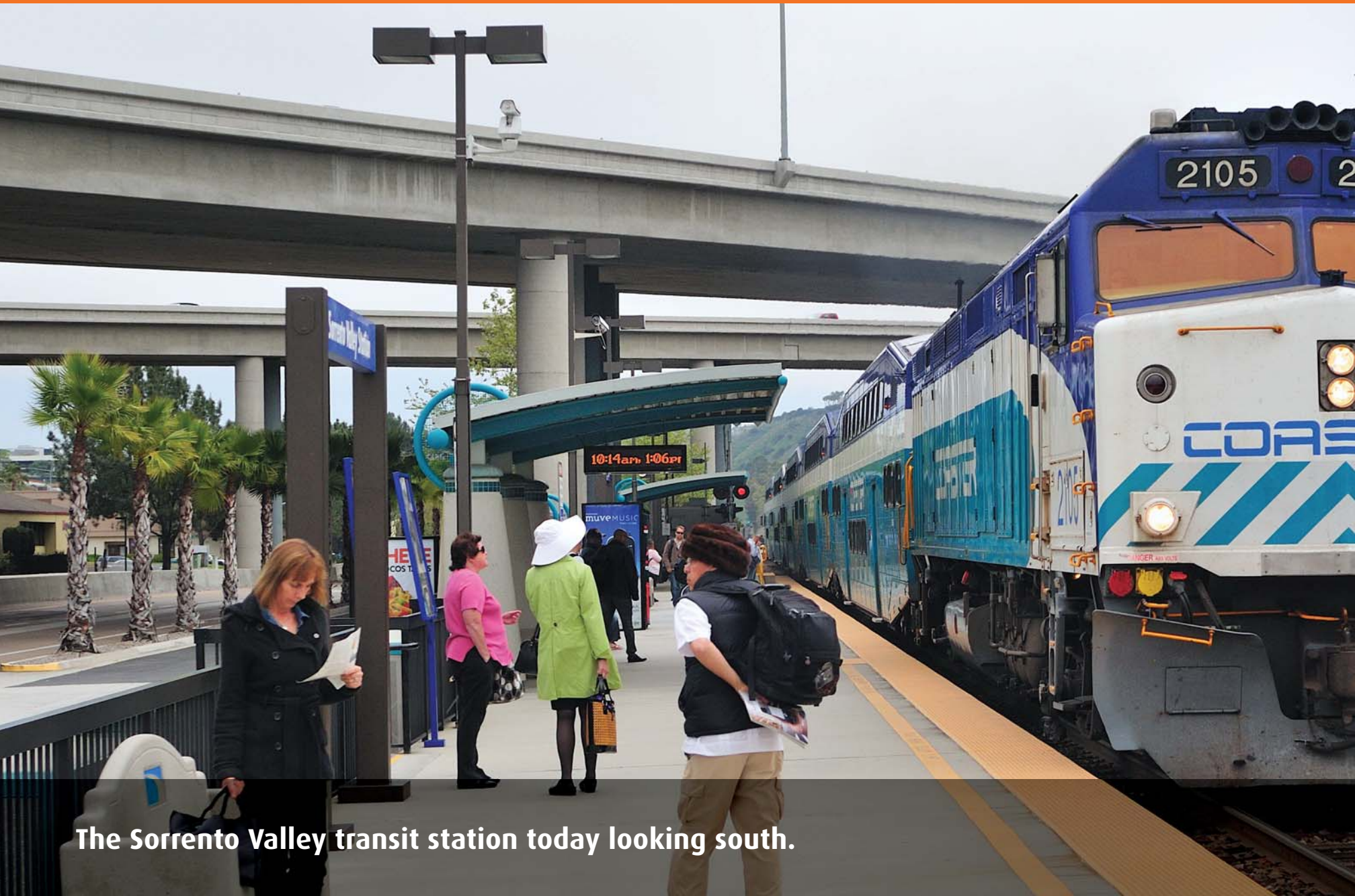
The Sorrento Valley transit station today looking south.