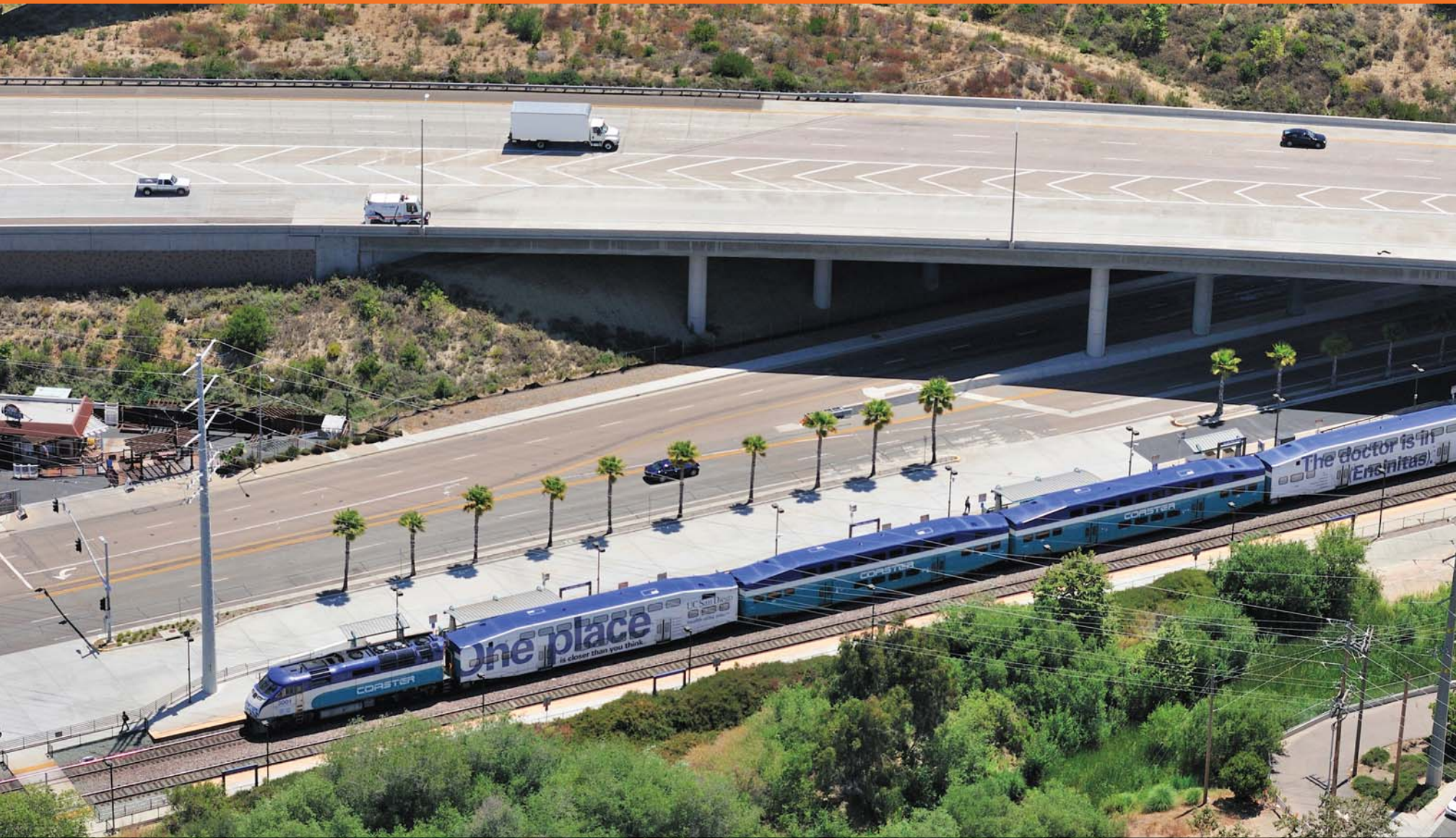
The Sorrento Valley transit station today looking east.