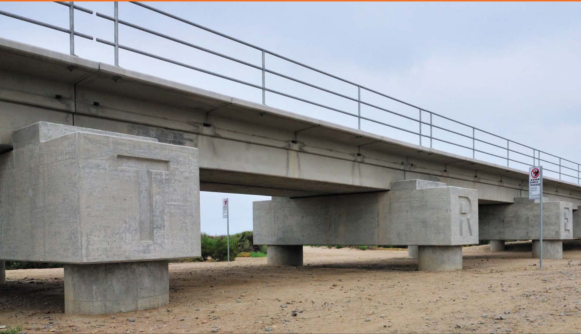
An example of a new concrete trestle bridge similar to the one planned for the Sorrento Valley Double Track project.