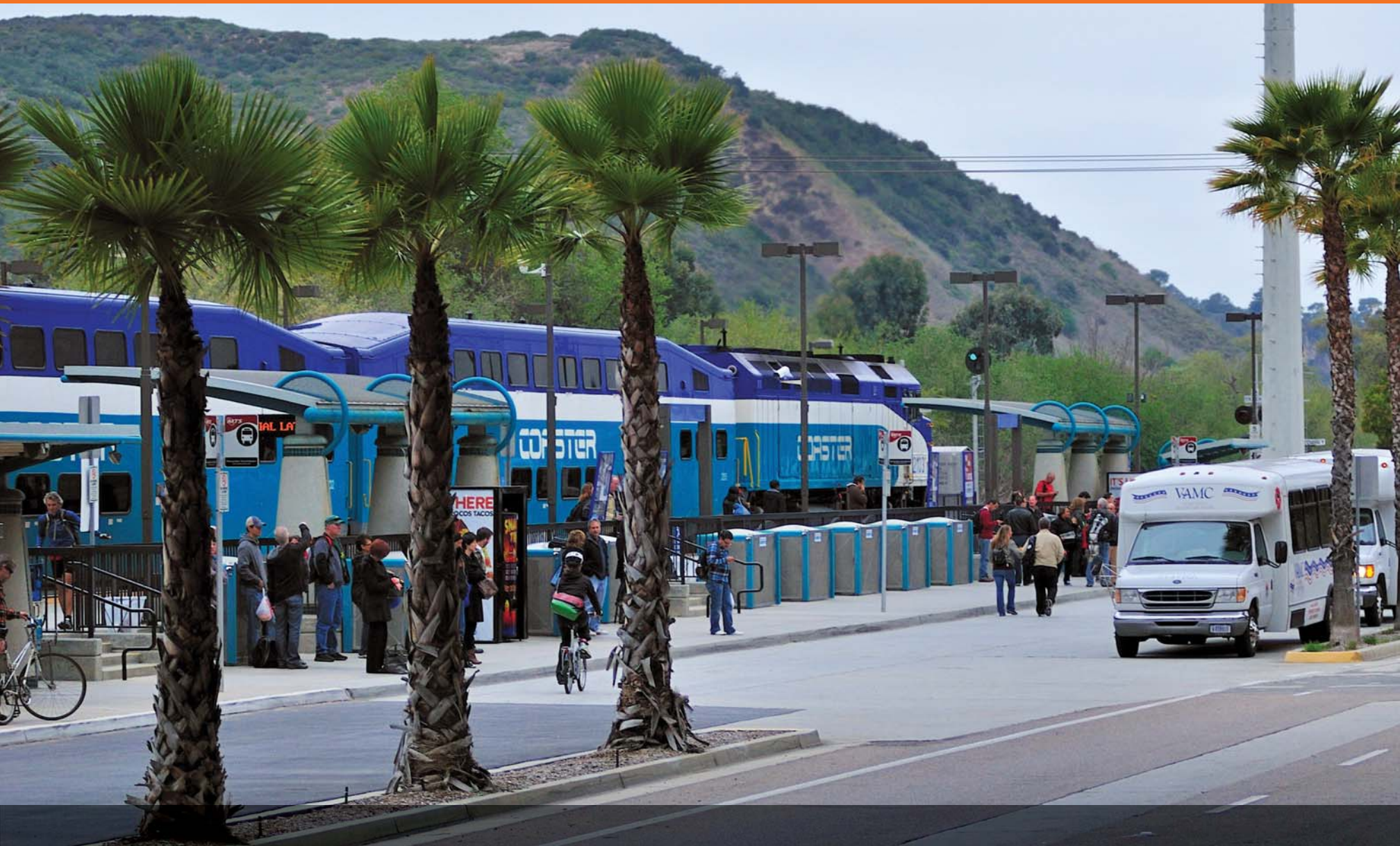
The Sorrento Valley transit station today looking northwest.