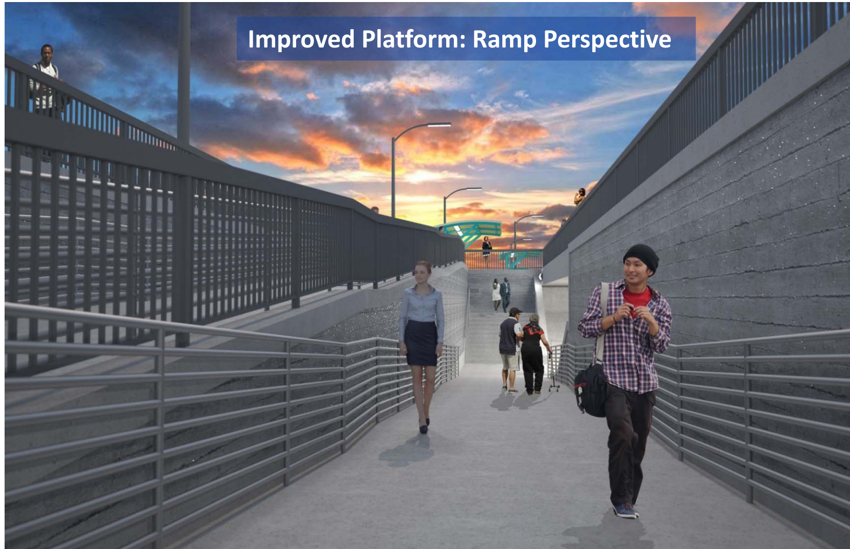
Improved Platform: Ramp Perspective