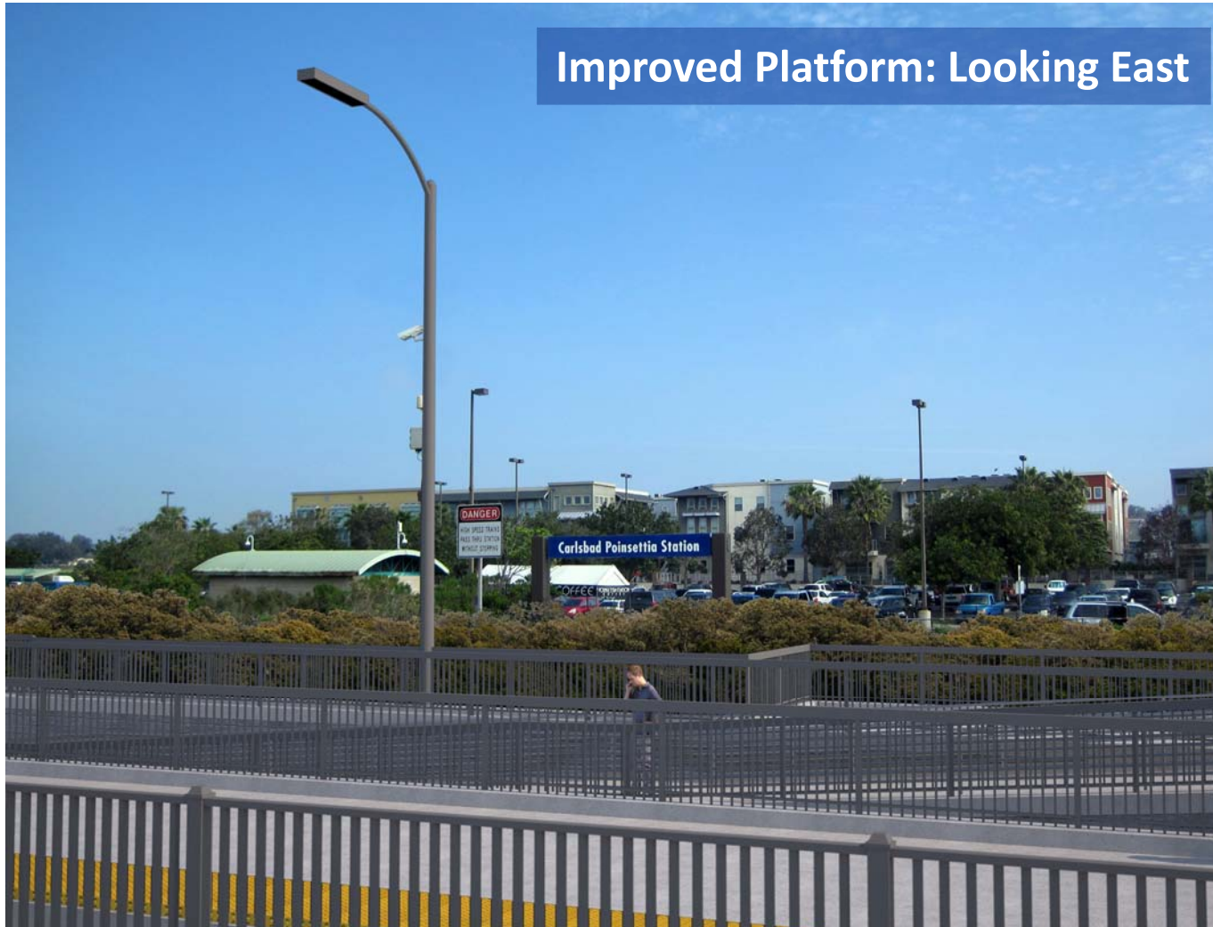
Improved Platform: Looking East