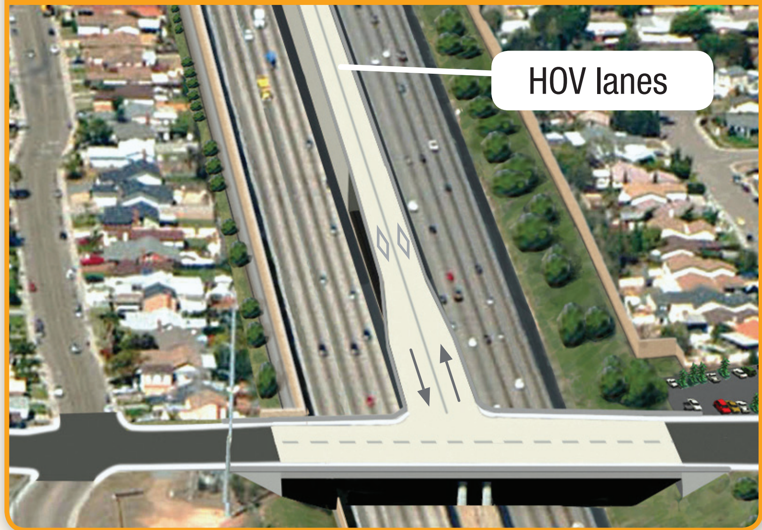
Direct Access Ramps connect the HOV lanes to local surface streets.