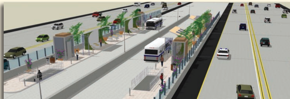
Convenient transit stations such as the one illustrated to the left will be constructed on the freeway as part of Phase 2.