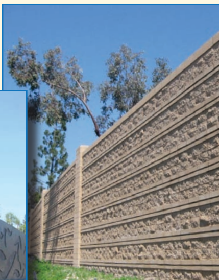
Caltrans will identify locations along the I-805 South Project route that may be eligible for sound walls and retaining walls similar to those pictured here.