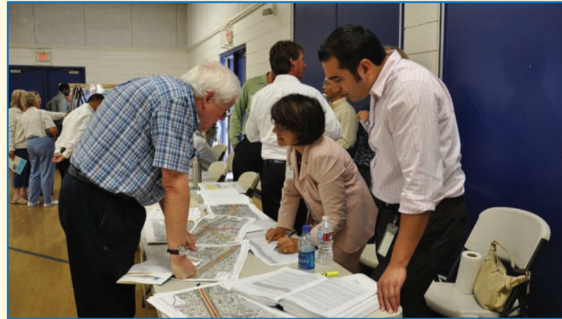
Caltrans staff members answer questions about the I-805 South Project at a public hearing held on September 21.

More than 100 community members attended the meetings, where they viewed a PowerPoint presentation, circulated among a number of stations covering various project-related topics, and provided written and verbal feedback on the environmental document. Caltrans and SANDAG staff and personnel from the City of Chula Vista were also on hand to answer questions.