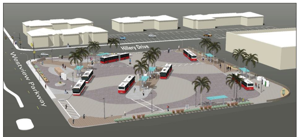
Simulation of the Miramar College Transit Station in Mira Mesa.

Additionally, work is currently underway at the Del Lago and Rancho Bernardo Transit Stations to create more bus staging areas and shelters for travelers.