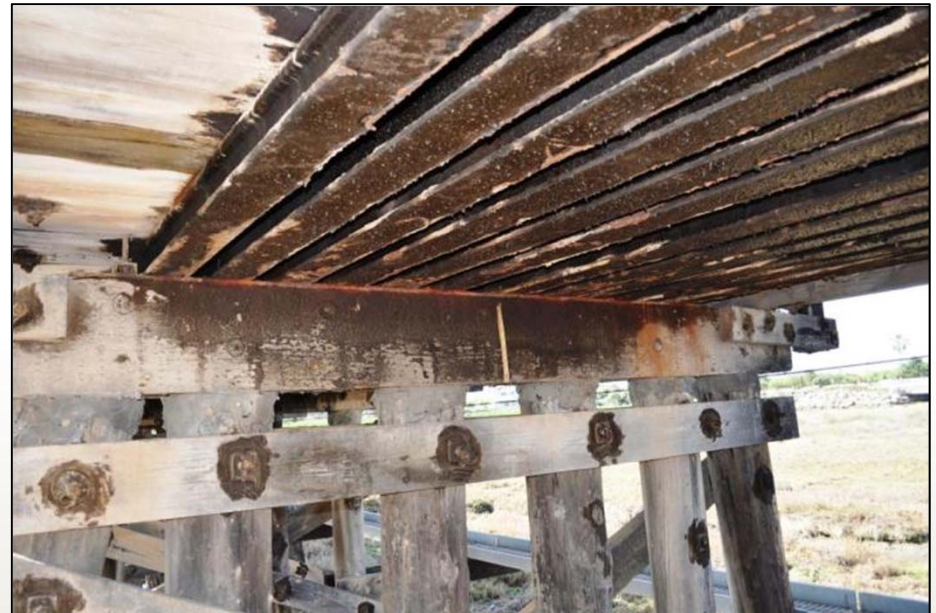
Existing San Dieguito Bridge