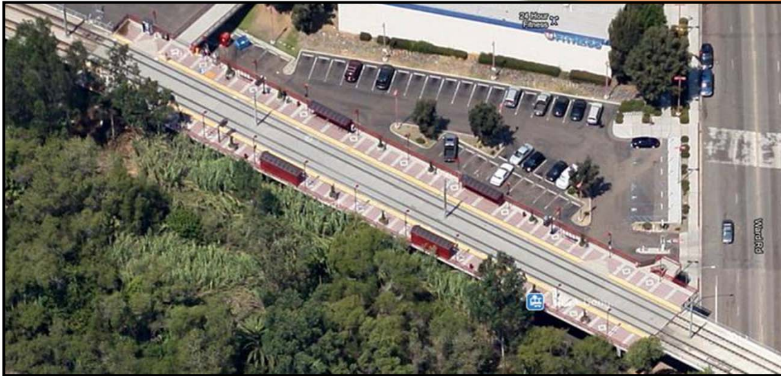
Side Loading Platform