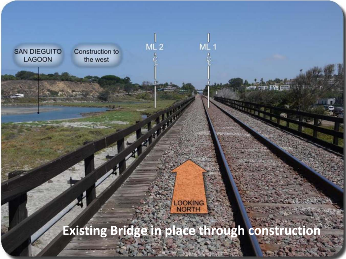
Existing Bridge in place through construction