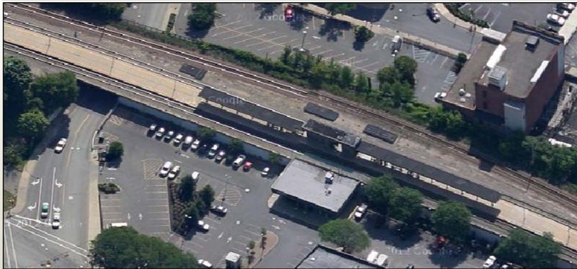
Center Loading Platform