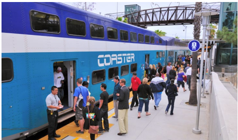
Fair attendees arrive at the Solana Beach Train Station. Currently, attendees using the train need to transfer to a shuttle bus to take them to the Del Mar Fairgrounds entrance.

A 2011 survey conducted at the fair and horse races showed that many travelers would utilize a new platform if in place. Specifically, attendees of these special events were asked, "If a train stop were to be located at the fairgrounds, would you have taken it?" Over 40% of attendees answered, "Yes, definitely" and another 20% said "Yes, probably." Based on the survey, the special events platform could significantly reduce daily traffic congestion by taking thousands of cars off I-5, Highway 101, and local streets each event day.