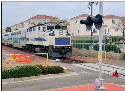
The City of Oceanside is leading an effort to incorporate the Surfrider Way and other intersections into a future Quiet Zone to limit train horn noise for nearby residents.