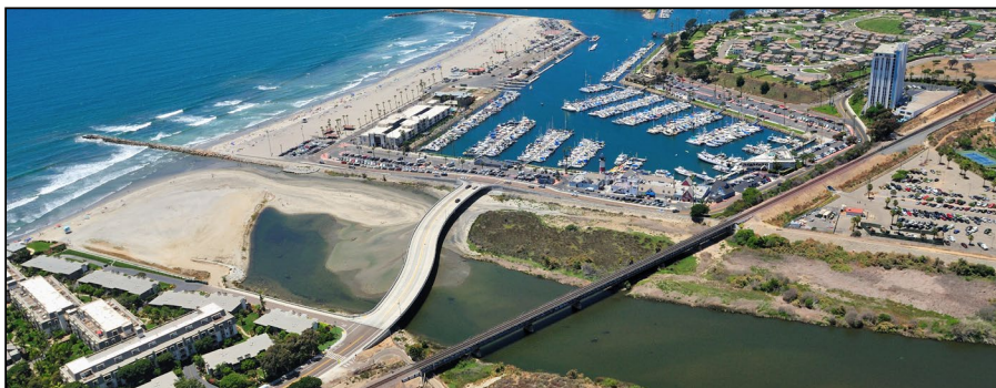
The aging San Luis Rey River rail bridge will be replaced with a concrete double-track bridge similar to the materials used for the N. Pacific St. road bridge shown above.

The current rail bridge, built in 1929 and rehabilitated in 1970, will be replaced with a modern, concrete double-track bridge to ensure trains run on time. The new bridge will be constructed east of the existing bridge. The existing bridge will remain operational during construction to avoid disruptions to rail services.