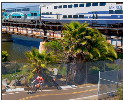
SANDAG will improve the undercrossing under the rail bridge that connects bikers and pedestrians to the San Luis Rey River Trail.