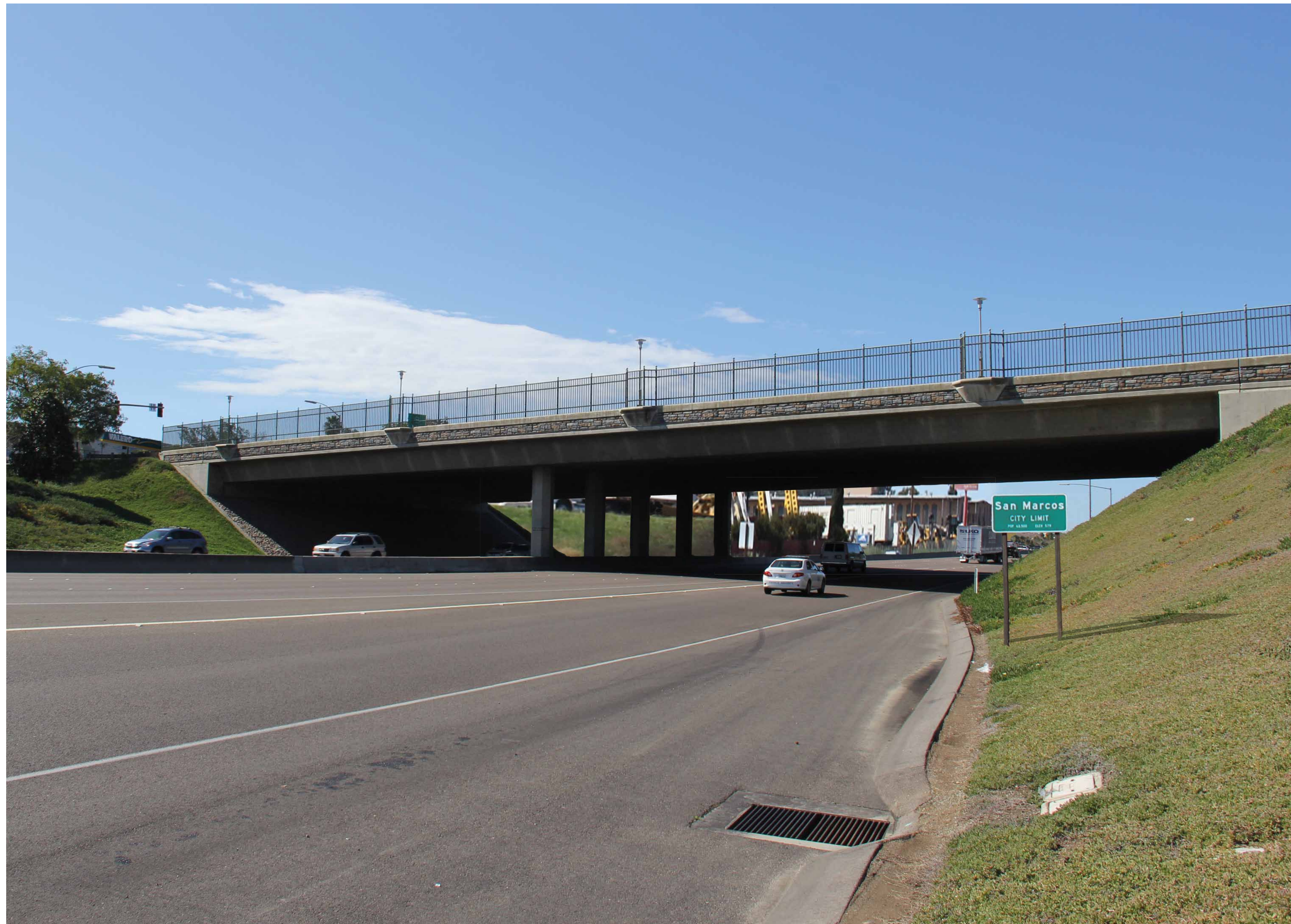
Completed Bridge Photo Simulation: Looking West