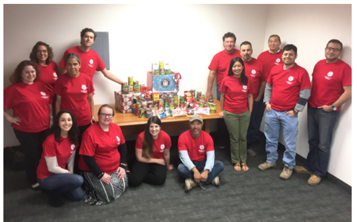
Project team members from the SR 15 Mid-City Centerline Rapid Transit Stations Project and the SR 15 Commuter Bikeway joined staff from the City Heights Community Development Corporation (CDC) to donate food to the CDC's Resident Services Program's local food pantry.