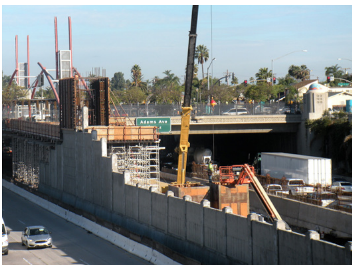
Crews are making progress building the pedestrian bridge and elevator structure in the SR 15 median south of El Cajon Boulevard.

Construction crews are wrapping up 2016 with more than 65 percent of construction completed on the State Route 15 (SR 15) Mid-City Centerline Rapid Transit Stations project. Crews continue to pave the transit-only lanes in the SR 15 median, which Rapid vehicles will use to access the freeway-level transit stations. Work also continues on the pedestrian bridge and elevator building south of El Cajon Boulevard, and the elevator installation south of University Avenue.