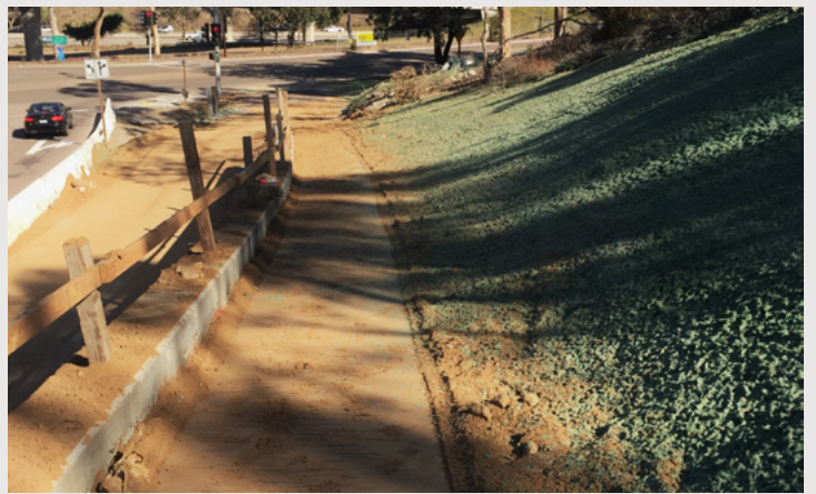
Crews are preparing the bike path at the Camino Del Rio South off-ramp of northbound SR 15. The SR 15 Commuter Bikeway will extend from Adams Avenue to this point at Camino Del Rio South along the east shoulder of the freeway, with the bikeway separated from vehicle traffic by a concrete barrier.