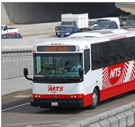
Rapid Express Vehicle running on the I-15 Express Lanes

Del Lago and Rancho Bernardo Transit Stations: Improvements at these stations included adding bus bays and new shelters, as well as installing next vehicle signs to provide updated bus arrival times. Construction began in August 2012 and was completed in March 2013.