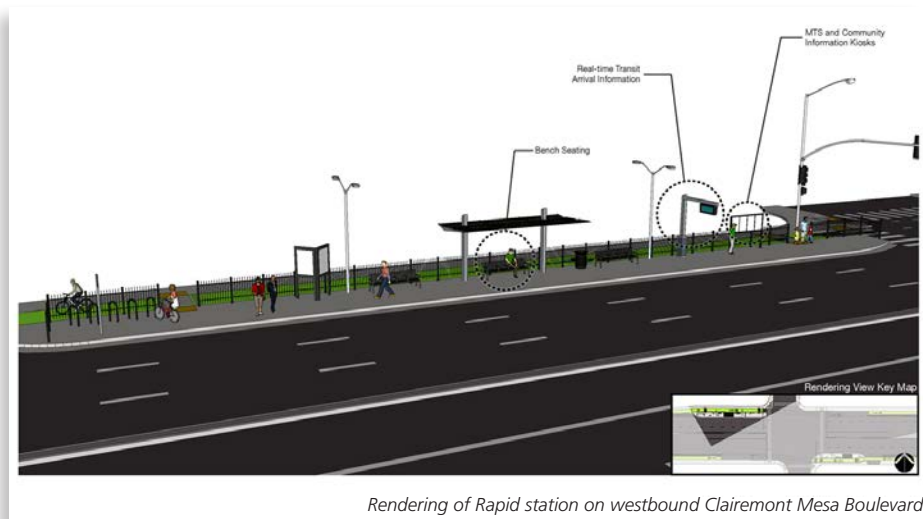
Rendering of Rapid station on westbound Clairemont Mesa Boulevard