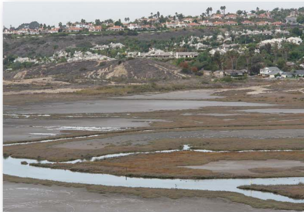
Hallmark, Agua Hedionda Lagoon

Ownership Management: Caltrans Conservation Easement to SANDAG: No Native Habitat Restoration Proposed: Yes