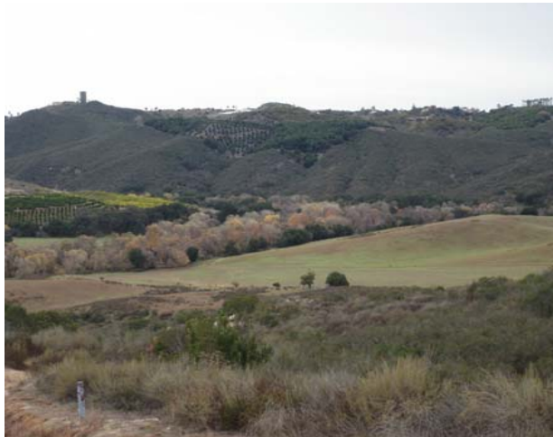
Rancho Lilac, Valley Center

Ownership: Caltrans Management: Caltrans Conservation Easement to SANDAG: No Habitat Restoration Proposed: TBD