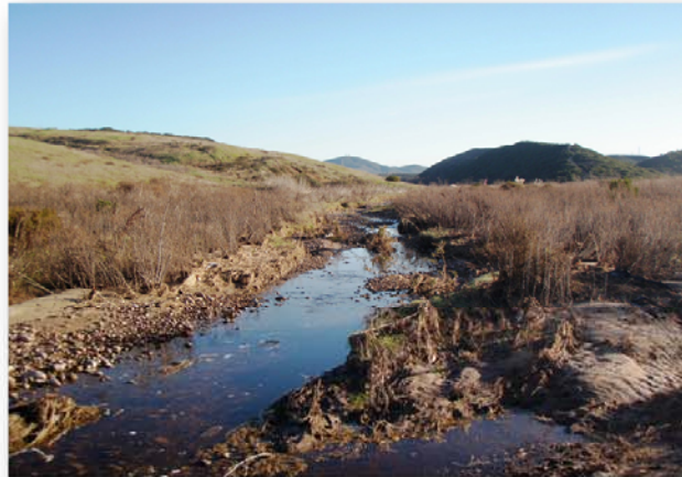
Deer Canyon, Carmel Valley

Ownership: Caltrans Management: Caltrans Conservation Easement to SANDAG: No Native Restoration Proposed: Yes