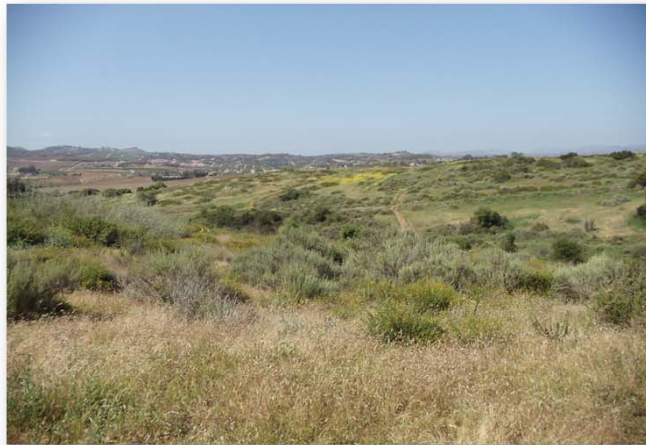
Jeffries Ranch, San Luis Rey

Ownership: Caltrans Management: Caltrans Conservation Easement to SANDAG: No Native Habitat Restoration Proposed: No