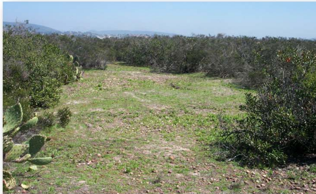
Zamudio, Del Mar Mesa

Ownership: Caltrans Management: Caltrans Conservation Easement to SANDAG: No Native Habitat Restoration Proposed: No