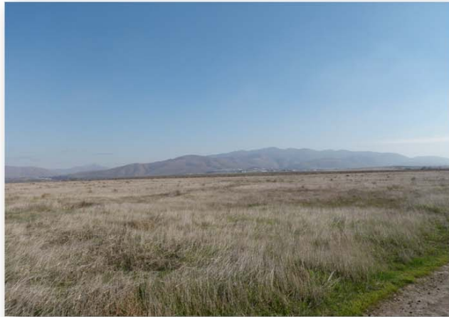
Lonestar Ridge, East Otay Mesa

Ownership: Caltrans Management: Caltrans Conservation Easement to SANDAG: No Native Habitat Restoration Proposed: Yes