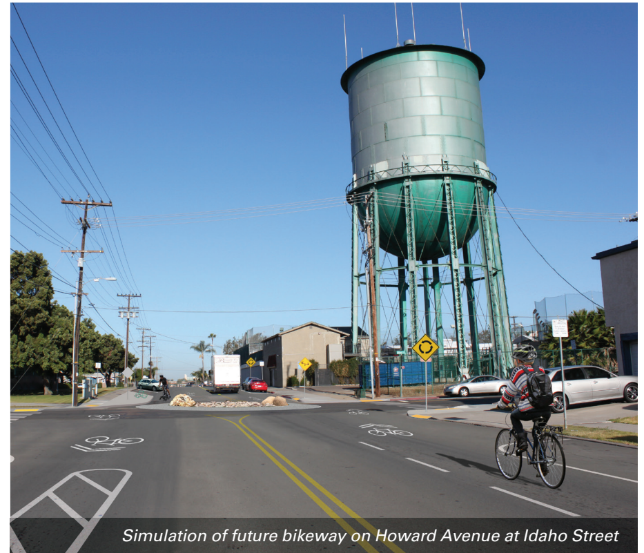
Simulation of future bikeway on Howard Avenue at Idaho Street