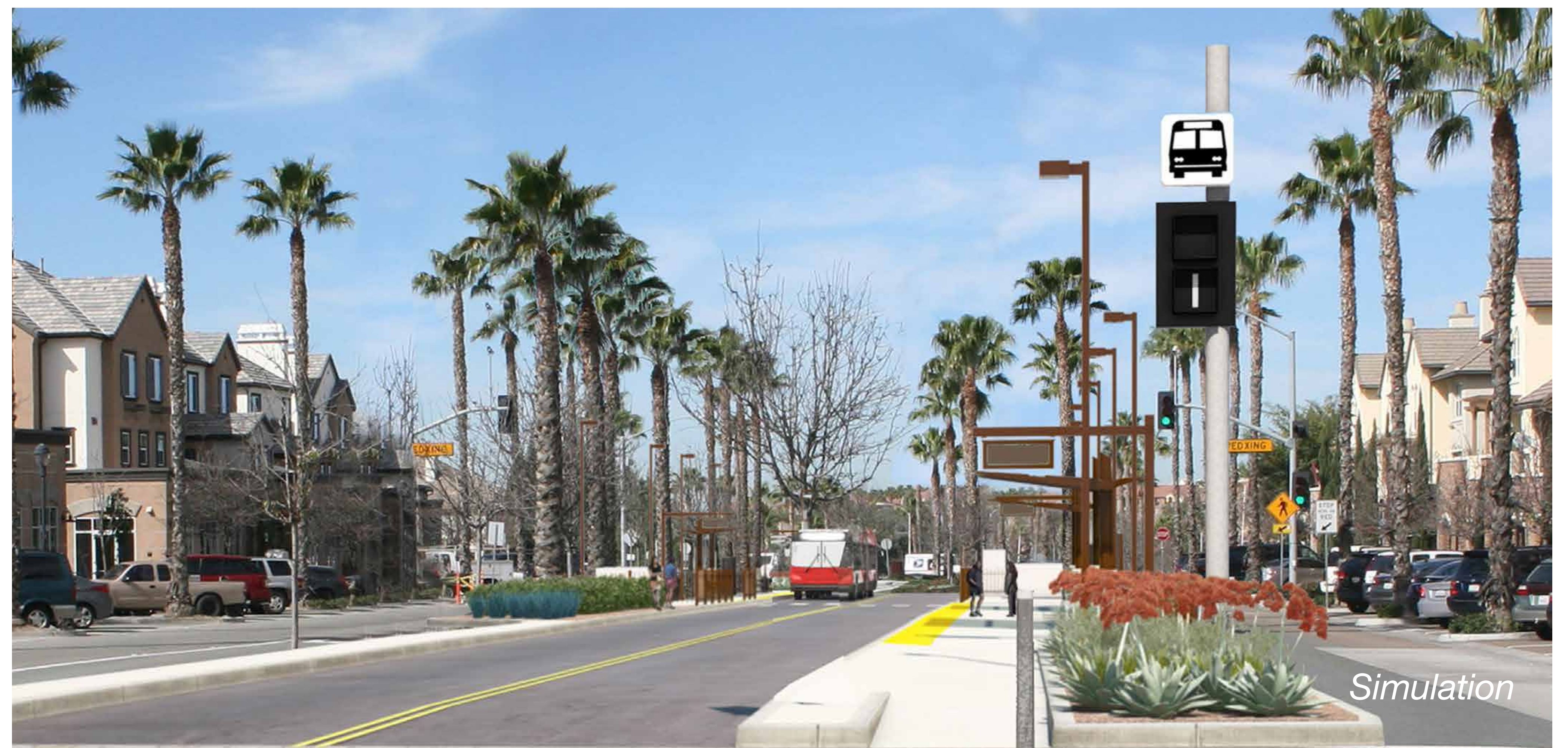
Santa Venetia Station (East Palomar Street at Magdalena Avenue)