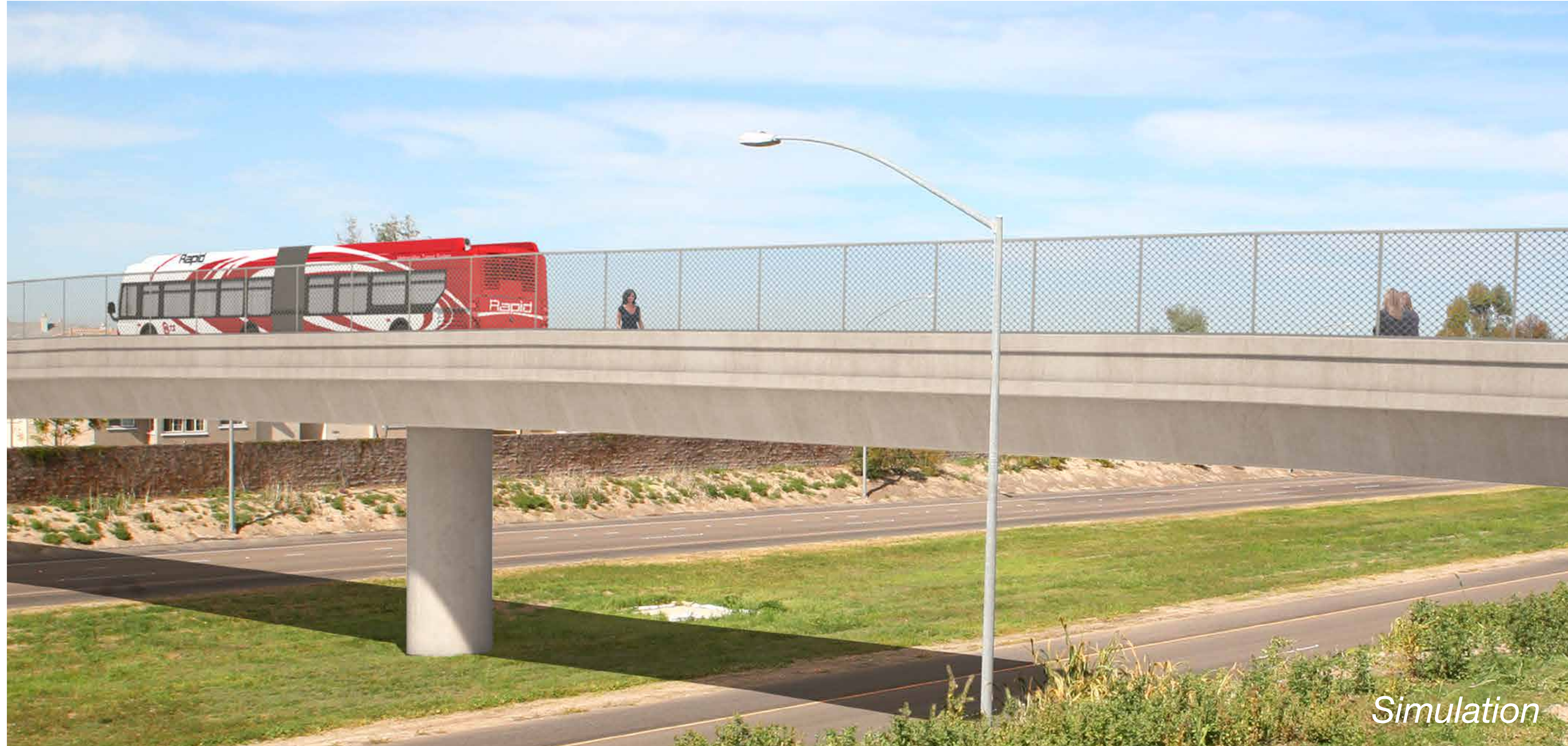
Transit guideway bridge over South Bay Expressway