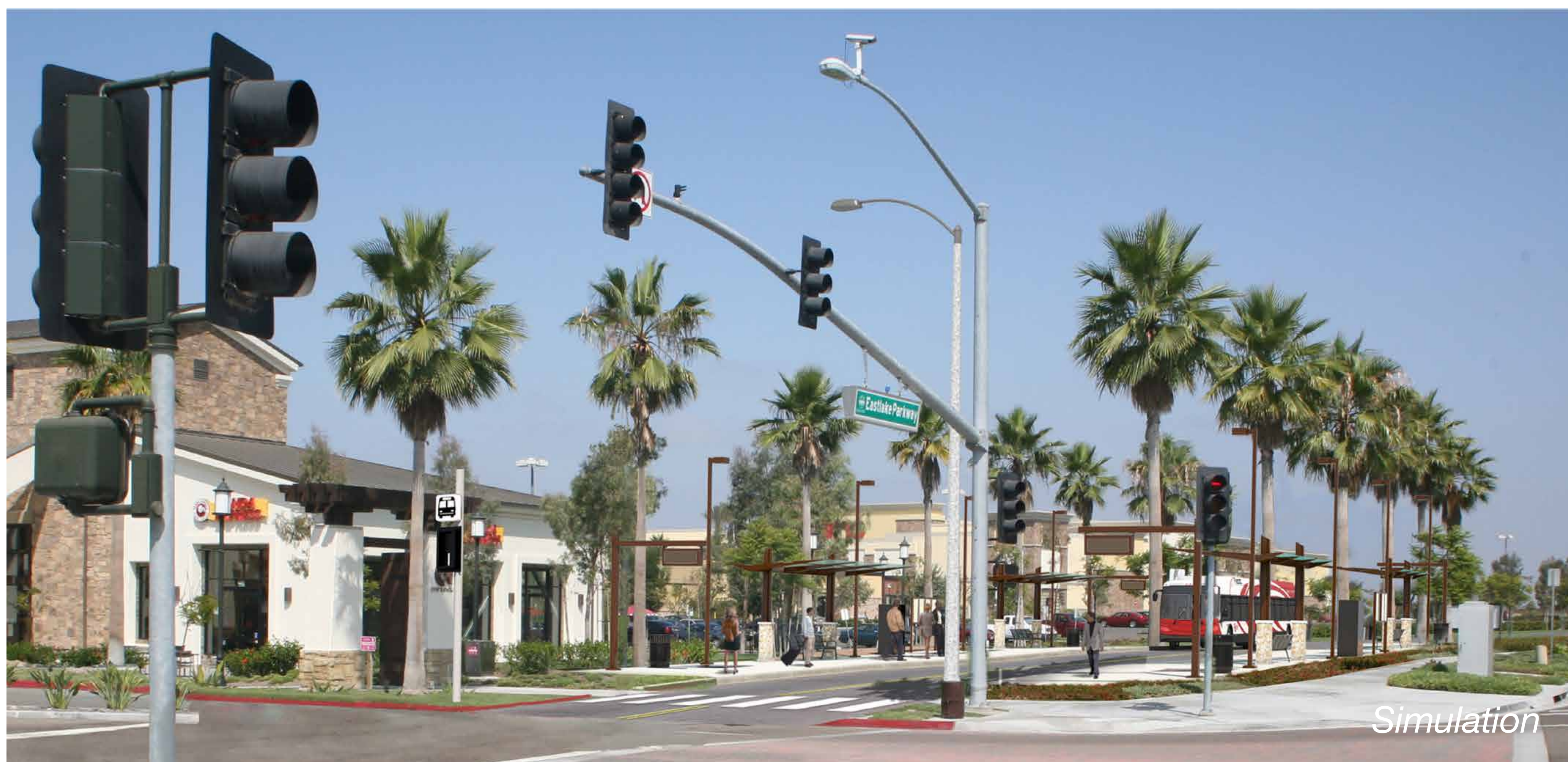
Otay Ranch Station (Eastlake Parkway at Kestrel Falls Road)

New transit service coming to South County.