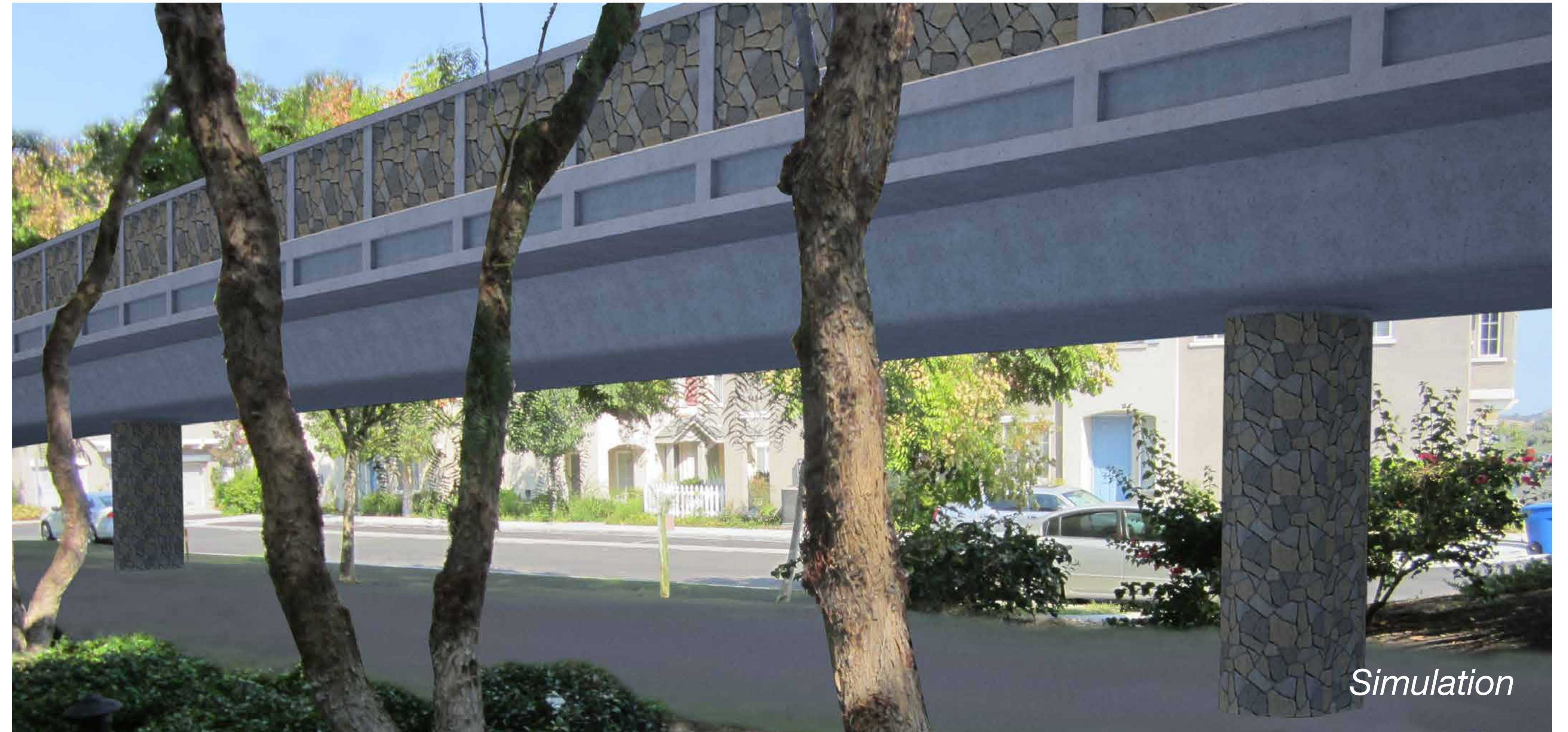
Transit Guideway Bridge adjacent to Impressionist Drive

Otay Mesa Transit Center – The Otay Mesa Transit Center near the United States-Mexico Port of Entry will serve as a welcoming gateway between the two countries.