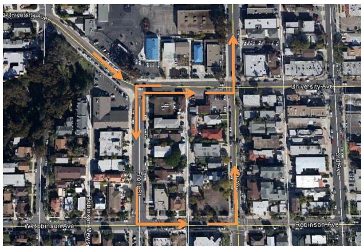
Circulation Study Zoomed Map